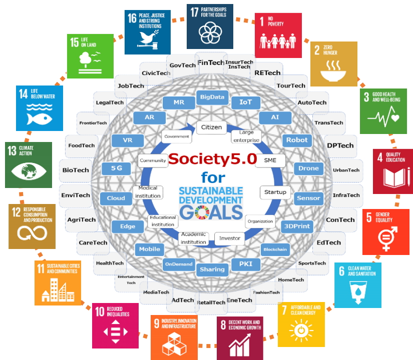
[Figure 2 Society 5.0 for SDGs]

management; (6) avoiding costly unplanned downtime for a number of industries; and (7) enabling new and improved products and services. At the same time, we recognise the necessity of public-private collaboration so that no one will be left behind by this transformation. For this purpose, it is imperative for governments to take concrete and immediate policies and measures in the seven areas which are set out below, in close consultation with business.