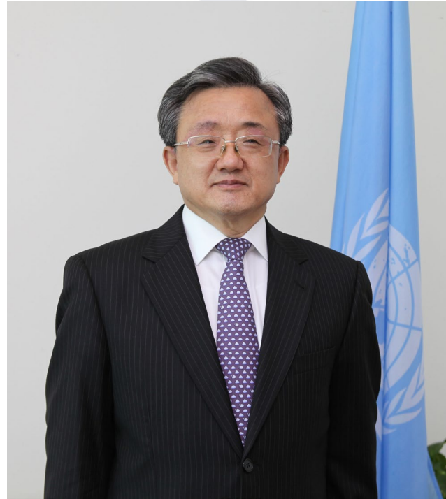
H.E. Liu Zhenmin Under-Secretary-General, United Nations Department of Economic and Social Affairs