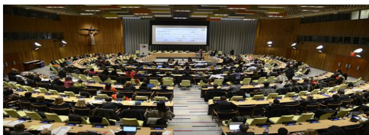
2014 Awards presented at UN Headquarters in NYC

To learn more about the Awards process, criteria, categories, and past recipients please visit: